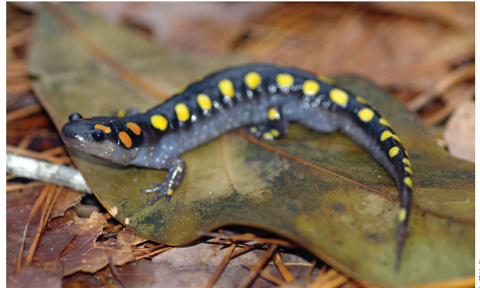
Figure 3. The spotted salamander ( Ambystoma maculatum ) can be found in forests through much of the eastern United States.

As a group, amphibians have complex and varied life histories. Frogs and some salamanders like this spotted salamander (Figure 3) lay eggs in water, and their young hatch as aquatic larvae but live their adult lives on land or a combination of land and water. Some amphibians (especially some salamander species) lay eggs on land in moist places. Amphibians' eggs do not have shells, and, like adult amphib-