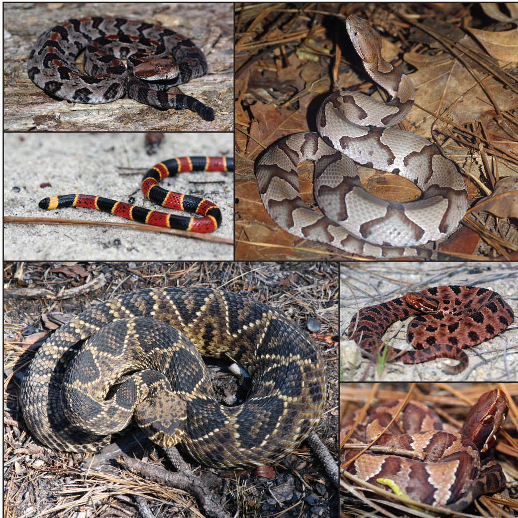
Figure 17. North Carolina's six native venomous snake species. Clockwise from upper left: timber rattlesnake ( Crotalus horridus ); copperhead ( Agkistrodon contortrix ); pigmy rattlesnake ( Sistrurus miliarius ); cottonmouth ( Agkistrodon piscivorus ); eastern diamondback rattlesnake ( Crotalus adamanteus ); eastern coral snake ( Micrurus fulvius ).

The next time you hear the symphony of frogs greet you on a warm evening, you will have a better appreciation for the amazing lives of the diverse amphibians and reptiles that live in North Carolina. Even more importantly, you will know some simple, enjoyable, and effective steps that you can take to ensure the symphony continues year after year.