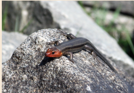
Figure 15. Rock Piles