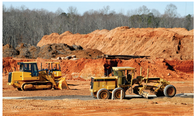
Figures 10-12. Threats to reptiles in developed areas include habitat loss and fragmentation, traffic hazards, pollution, and increased sedimentation due to construction.

kill the invertebrates that amphibians eat. Insecticides reduce herps' food supply, as insects make up much of the prey for both reptiles and amphibians.