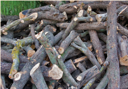
Figure 14 . Log/Brush Piles