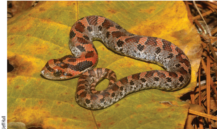
Figure 2. The eastern hognose snake ( Heterodon platirhinos ) uses its upturned snout to dig in sandy soil. It will play dead if threatened.

wildlife. Herp absence from an area where one would expect to find them can indicate that there is an environmental problem.