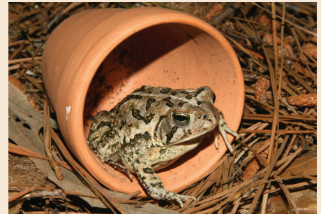
Figure 16. Amphibian houses

Note: Pictured above is a five-lined skink ( Eumeces [Plestiodon] fasciatus ).