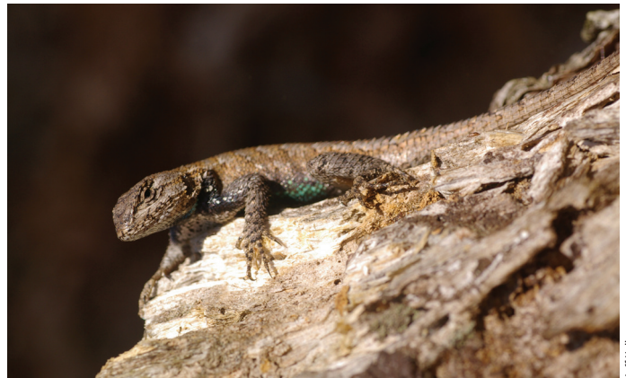
Figure 4. An eastern fence lizard ( Sceloporus undulatus ) basks on a log to warm its body.

ians, they are vulnerable to pollutants.