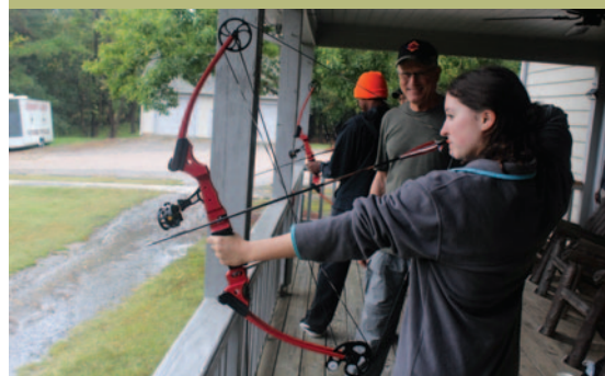
YOUNG ADULTS ENJOYING A DAY AT THE ARCHERY RANGE WITH FEDERATION PARTNER WAKE COUNTY WILDLIFE CLUB AS PART OF THE ACADEMICS AFIELD INITIATIVE.