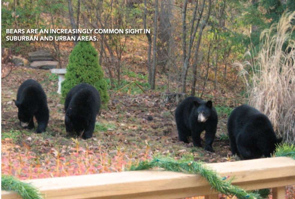
BEARS ARE AN INCREASINGLY COMMON SIGHT IN SUBURBAN AND URBAN AREAS.

Urban bears were vulnerable to legal bear harvest in the Asheville region. Monthly survival during the hunting season was lower than the non-hunting season, demonstrating that legal harvest may be an important source of mortality affecting urban bear demography. Further, legal harvest was the second leading cause of mortality, thus, regulated hunting may be a viable management tool for urban bears in the Asheville region. Although our study confirms that urban bears are vulnerable to harvest, the impacts of harvest on bear density and population growth rates are unknown due to uncertainty in recruitment, immigration, and emigration. Future research focused on regional bear abundance, demographics, and movements could provide information for an adaptive research and management program investigating how the duration, timing,