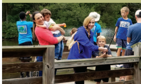
NCWF'S GREAT OUTDOORS UNIVERSITY PARTNERS THROUGHOUT THE YEAR FOR KIDS IN NATURE DAY EVENTS LIKE THE ONE HELD WITH OUR HABITAT AND WILDLIFE KEEPERS CHAPTER IN MATHEWS.

Wildlife and its habitats offer awe and wonder, but only if there are dynamic, meaningful experiences that put human communities in touch with the natural fabric of North Carolina. Outdoor experiences in backyards, fields, creeks, forests and parks provide a connection to the land, and underscore the responsibility humans have for the welfare of wildlife. NCWF works throughout the year to help provide outdoor avenues for learning, connecting and mentoring.