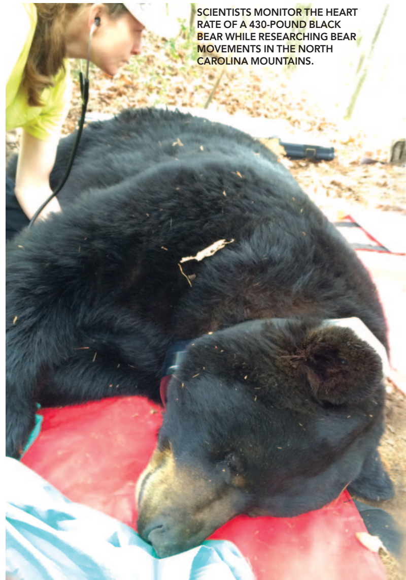
SCIENTISTS MONITOR THE HEART RATE OF A 430-POUND BLACK BEAR WHILE RESEARCHING BEAR MOVEMENTS IN THE NORTH CAROLINA MOUNTAINS.