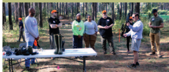
COLLABORATING PARTNERS NCWRC, NCWF, AND OUR LOCAL GASTON COUNTY CHAPTER PIEDMONT AREA WILDLIFE STEWARDS PROVIDED A FULL DAY OF EDUCATIONAL TRAINING FOR PARTICIPANTS WHO HAVE NEVER HUNTED AND DO NOT HAVE MENTORED SUPPORT.